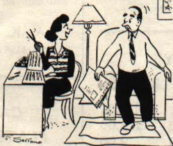
"But aren't the early issues more valuable without perforations!?"