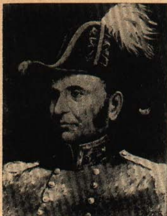
Lieut. Colonel John By