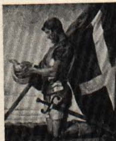
GE& INF. PGT. 29 STABSTRUPPEN AKTIVDIENST 1940

If you are looking for a special field start collecting them now!