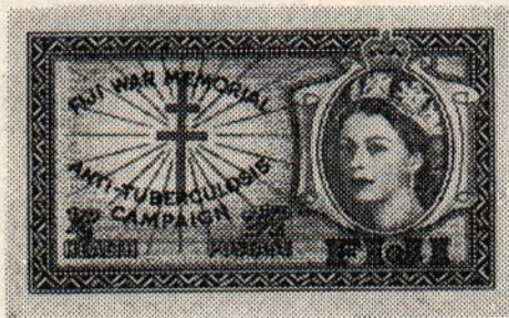
New Fiji Health Stamp

The stock of Jean de Sperati, maker of high precision reproductions of rare stamps, together with