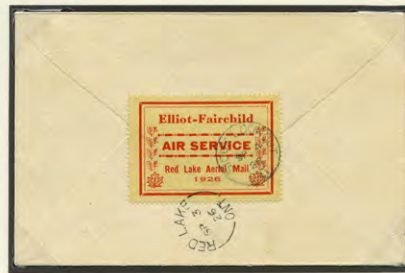
Only 10 reported covers have 1st issue sticker. Months after Elliot-Fairchild Air Service ended, this commercial cover was honoured by Patricia Airways and Exploration. P/m Red Lake September 3, 1926, b/s Sioux Lookout September 4.